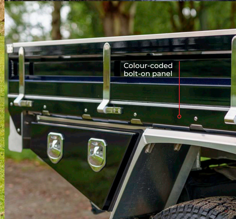
Colour-coded bolt-on panel