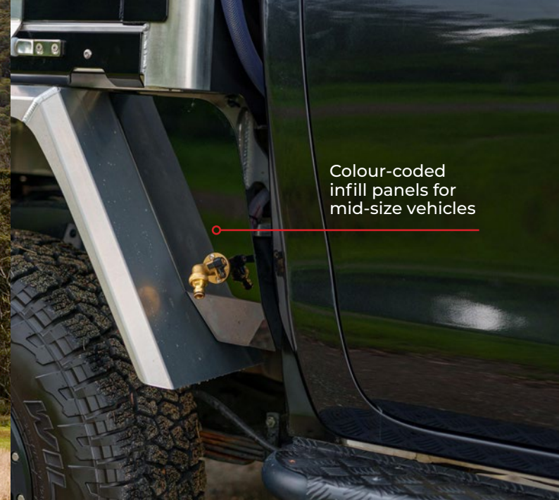
Colour-coded infill panels for mid-size vehicles